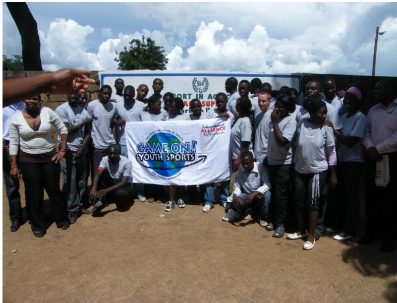
IAYS and Sport In Action join forces to implement Game On! Youth Sports throughout Africa

Other requirements may apply and participants will be notified if there are any other requirements, changes or additional information needed in order to proceed in coordinating your arrangements.