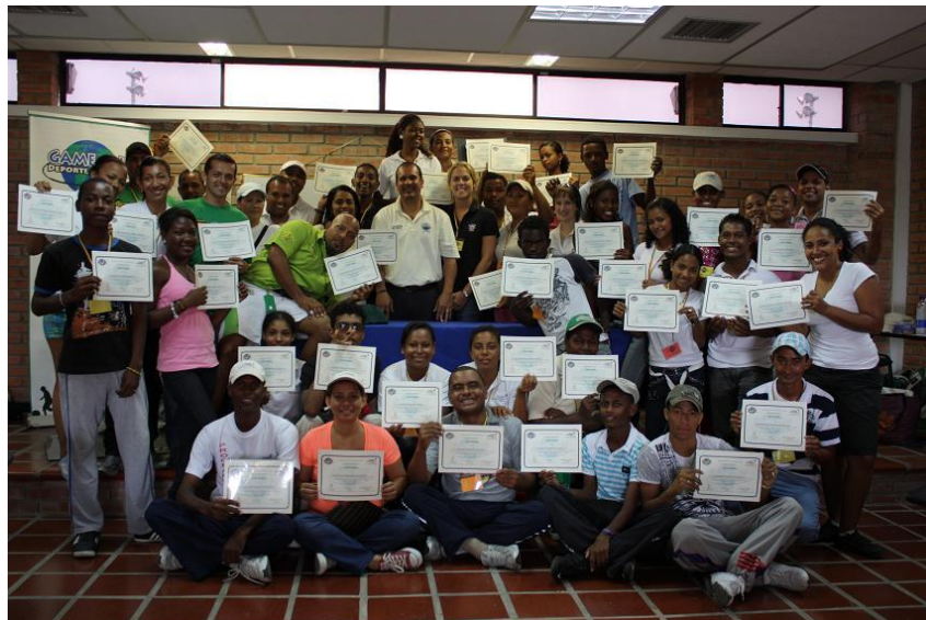
Game On! Youth Sports Training Cartagena, Colombia 2010